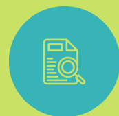
Total HFA Ltd revenue for 2023/2024: $177,485

in prevention programs and financially sustainable social enterprises like SHIFT, Sustainable Healthy Integrated Food Towns in the Hepburn Shire